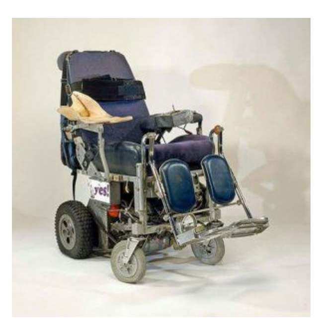
Ed Roberts'—a major disability activist and member of the Rolling Quads—powered chair, now in the Smithsonian Museum's permanent collection.

Curb cuts, especially alongside the development of powered chairs, were a goddess-send for many wheelchair riders. They allowed people to navigate cities and communities alone, without attendants or needing assistance, and made whole parts of modern life accessible. A major narrative thread here (that the 99% Invisible episode I've referenced picks up very well) is the emergency of a popular view of disability that does much more than simply look down on folks with pity.