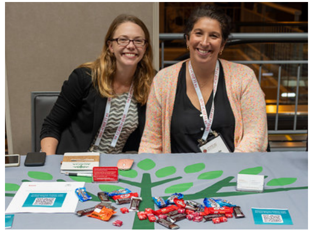
*Based on availability at time of sponsorship confirmation.

Please contact us at <a href="mailto:conference@lgbtqbar.org">conference@lgbtqbar.org</a> for more information, or to discuss remaining opportunities and the possibility of custom packages. Space is extremely limited - reach out before we sell out!